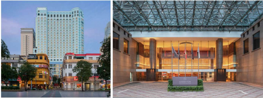
Sheraton Saigon Grand Opera Hotel Address: 88 Dong Khoi, District 1, Ho Chi Minh City Phone Number: +8428 3827 2828